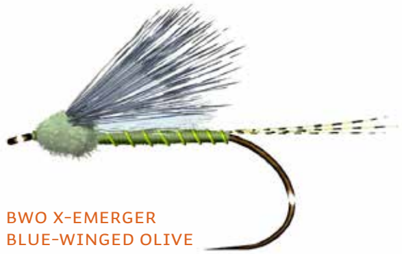
BWO X-EMERGER BLUE-WINGED OLIVE

bend. Tie in three barbules of barred wood duck flank feathers. The length should be about the length of the body or a bit shorter.