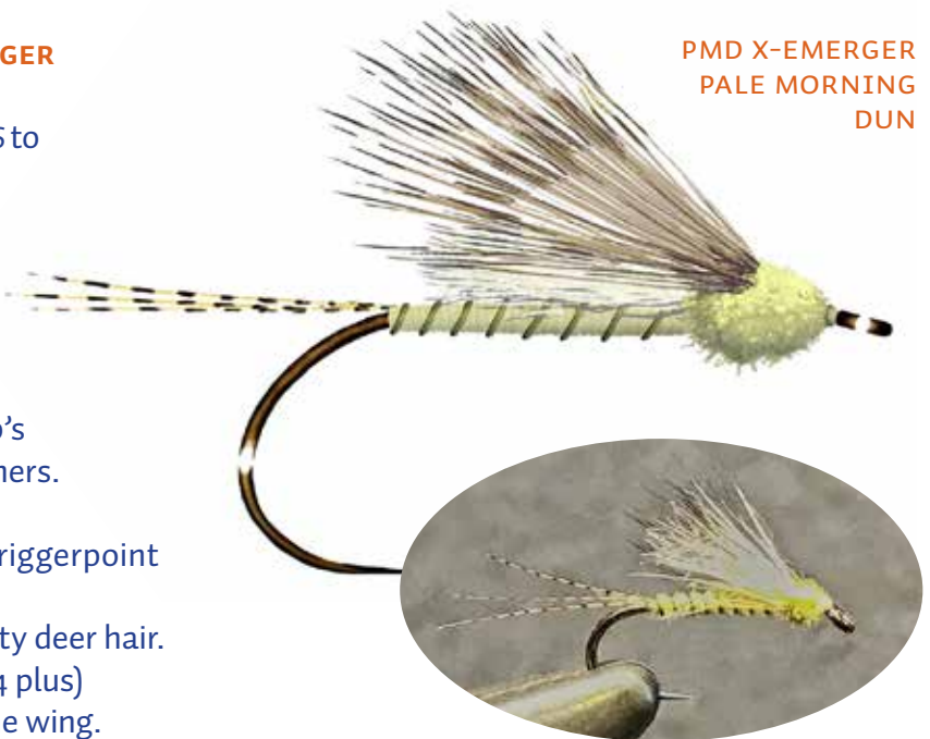
PMD X-EMERGER PALE MORNING DUN