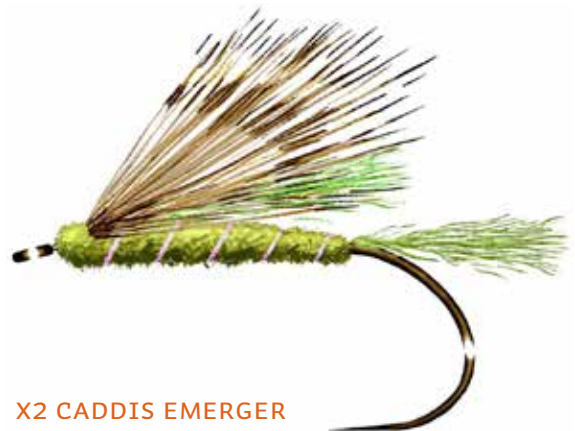
X2 CADDIS EMERGER

Your best bet in finding good quality Comparadun deer hair is to check out those packaged by Nature Spirit or buy it from Blue Ribbon Flies. Both are excellent, though Blue Ribbon will run out of stock quickly once you've read in their newsletter that they have it. For Comparadun-style elk hair, the only place I am aware of is Blue Ribbon Flies.