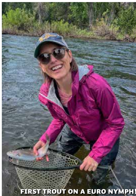
FIRST TROUT ON A EURO NYMPH!

Fishing in high water can present both challenges and opportunities. High water can be dangerous: I had to be mindful of fast currents, hidden objects, and potential debris in the water. I decided to focus on edges and soft water, and look for areas where the current is slower, such as along the banks, behind