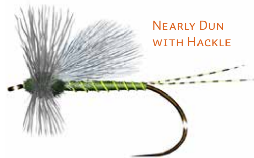
NEARLY DUN WITH HACKLE