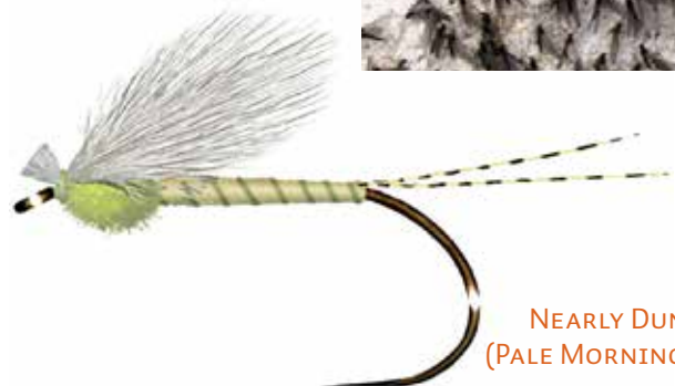
NEARLY DUN PMD (PALE MORNING DUN)