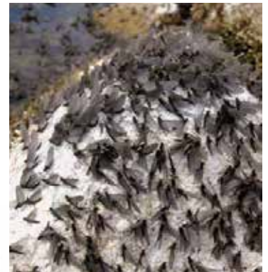
BLUE-WINGED OLIVES HATCHING ON THE GREEN RIVER (APRIL 2018)