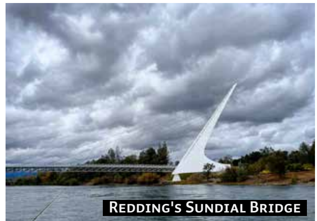
REDDING'S SUNDIAL BRIDGE

A large part of the fun of our trips is the camaraderie among members at breakfast and dinner. The Red Lion Hotel in Redding offered great hospitality. The hot breakfasts were top notch. The last night saw us all dining at Cattlemen's Restaurant, laughing and drinking the night away. Another great NorCal Steelhead trip was in the books.