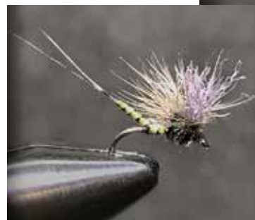
#20 STACKED EXTENDED THREAD AND WIRE BODY BWO

The one fly I am totally pleased with is what I used for dry fly fishing. Many of you know I have gotten back to tying extended bodied flies like those I tied emulating Bing Lemke's iconic ties from forty years ago. Mine have stacked hackles, a wing and they worked really well! I caught nine fish and maybe more—all 17" to 19"—on a thread and wire bodied version as well as a dyed peacock eye quill version. And, more importantly, the flies held up to the numbers of fish caught and brown trout teeth. Especially the quill bodied version.