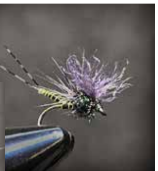
#20 STACKED HACKLE EXTENDED QUILL BODY BWO

Okay so how do I sum up this trip? Clearly, I could have stayed home and was told so from several friends. Yet I felt that I did weigh the risks and that flouting a gubernatorial order would still be a safe bet. Obviously I feel like I made the correct decision to go and was rewarded with one of the best trips of my life. The flies used were similar to previous years but with a few minor changes. Would I do it again? Hell, yeah!