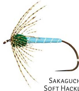
SAKAGUCHI SOFT HACKLE

was fishing near the third ramp when the occasional BWO flew by. I switched my bottom fly to an un-weighted Halo and the top fly to Wayne & Shirley's Soft Hackle and shortened the indicator distance. Both flies immediately produced results. It was then that clouds of BWOs were blown downstream by the wind and I ran down to the ramp itself where I knew there would be slack water and the possibility of a hatch.