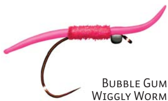
BUBBLE GUM WIGGLY WORM

This pattern uses the silicone rubber 'tentacles' off a child's toy to imitate worms flushed out due to the high water. Though it is easy to tie, you do need to be careful when attaching it to the hook because